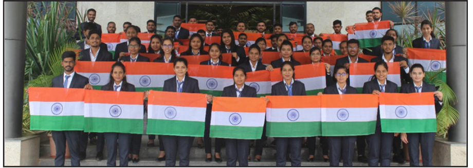
Celebration of 'Har Ghar Tiranga' under Azadi Ka Amrit Mahotsav – 13 to 15 August 2022