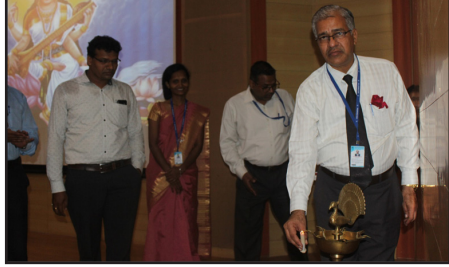
MCA & MBA – Farewell - 30 July 2022