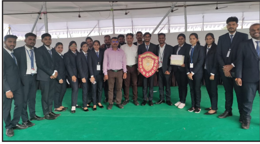
Special Achievement of MCA and MBA Students in Someshwar Technothon 2022 - 22 July 2022

Vidya Pratishthan's Institute of Information Technology (VIIT)