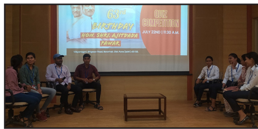
Quiz Competition on the occasion of 63 rd Birthday Celebration of Hon. Shri. Ajit Dada Pawar - 22 July 2022