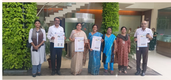
"Vidya Pratishthan: An Educational Hub"